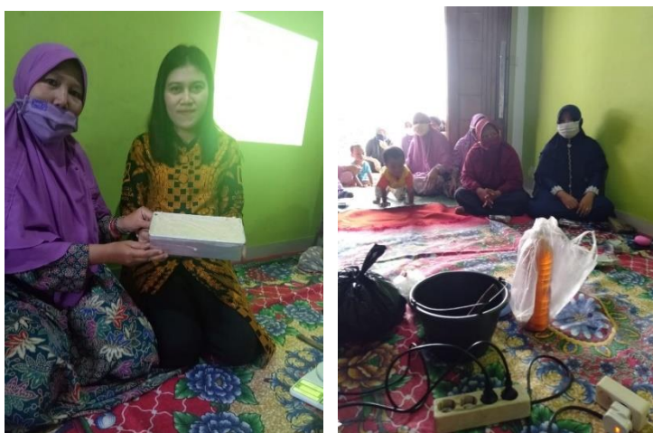
Gambar 3. Handmade Soap Making

This used cooking oil soap can be used for washing clothes, dishes, as a material for mopping floors, but it is not recommended as a bath soap. Not yet known the safety level of used used cooking oil soap, but he tried using Litmus paper which he thought could be a helpful indicator to see its safety. Soap with a pH of 8 means it is safe to use.