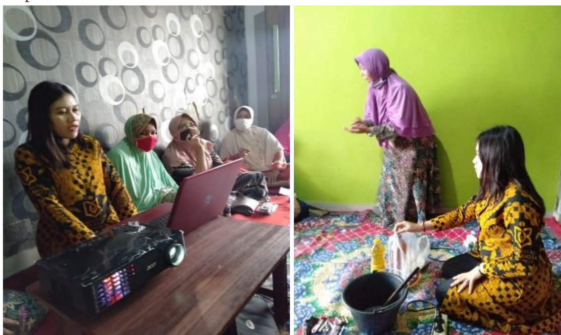
Gambar 2. Mentoring Steps

The service step taken is coordination in advance with coordination with the Wangen village, especially PKK mothers as partnerships with lecturers and students of Duta Bangsa University Surakarta. This stage discusses when the service will be carried out along with the place and time of implementation. The discussion also discusses the implementation of outreach and training. This counseling on community service discusses the material regarding formulas that must be prepared when making handmade soap. The training material contains materials, tools and methods of making soap.